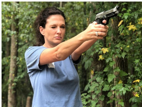
“Loyal NRA member” “Pro-gun”