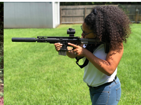
Supports guns everywhere (Open Carry)